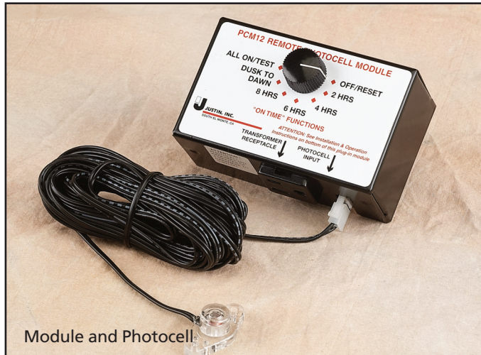
Module and Photocell