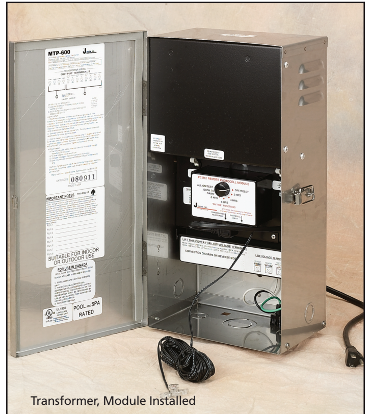
Transformer, Module Installed